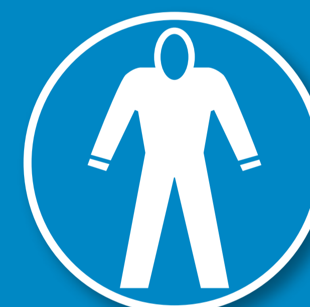
Protective overall with hood