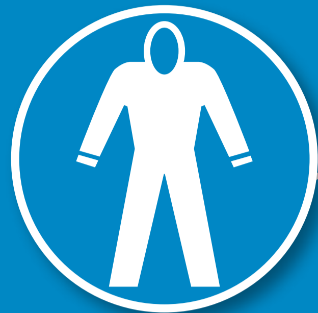
Protective overall with hood