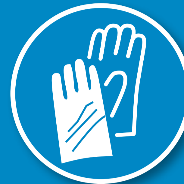
Gloves with cut protection