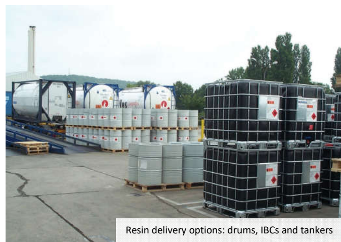
Resin delivery options: drums, IBCs and tankers