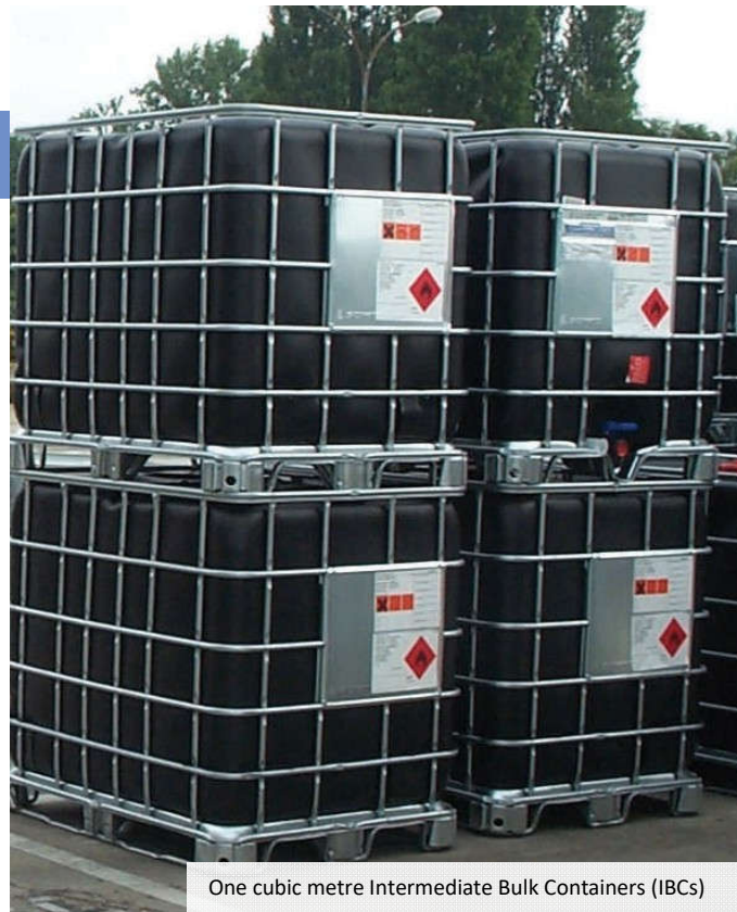
One cubic metre Intermediate Bulk Containers (IBCs)