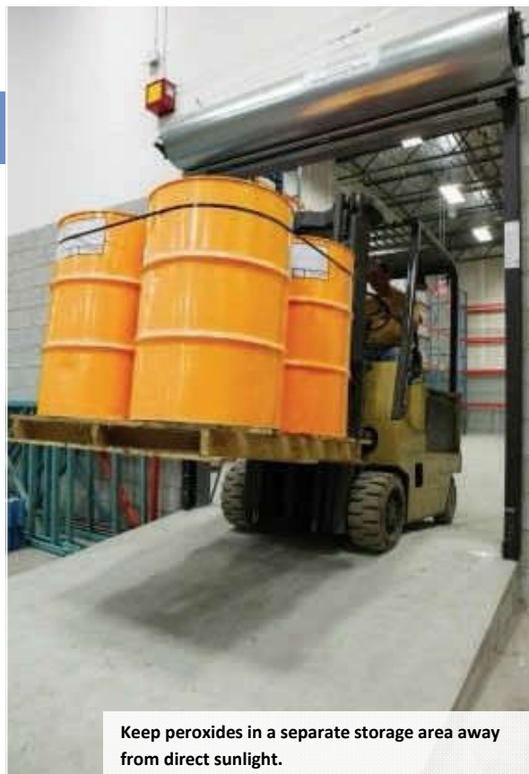
Keep peroxides in a separate storage area away from direct sunlight.

Small amounts of residual organic peroxides can be used to gel and cure resin waste in a controlled way. Larger amounts can be destroyed through controlled burning, but must be treated according to local regulations and instructions. Peroxide waste must not be stored in closed or air-tight containers. As a general rule, empty peroxide containers should be treated as special waste, and local authorities should be consulted in this respect